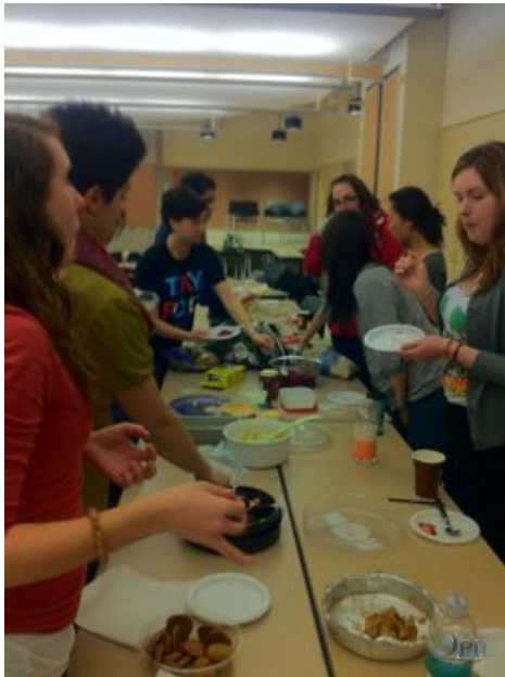
Final Forum Potluck, Spring 2011

Forum this year has already covered a wide range of topics and has explored many different ideas of development. We have had guest speakers who do work as diverse as providing guidance to Aboriginal students on campus, establishing renewable energy projects in First Nations communities in British Columbia, administering first aid and combating gang violence Haiti, and getting youth involved in community-building in Nicaragua. This semester we have also held forums that focus on each of QPID's summer projects. At these forums, we have critically examined QPID's involvement in and impact on communities in Ghana, Botswana, and Nunavut, and have all become more informed on the many issues facing these diverse areas. Next semester we will continue to hear from a variety of guest speakers and hope to build more connections with the Kingston community through the creation of the new position of the Community Outreach Coordinator.